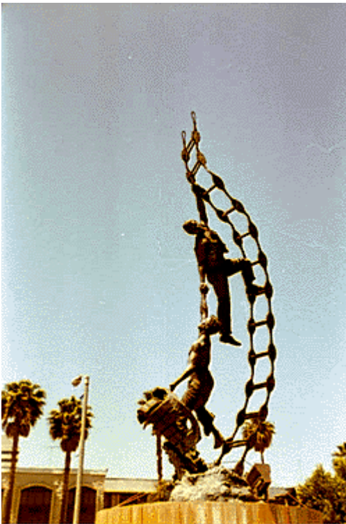
American Merchant Marine Veterans Memorial South Harbor Blvd At West 6th Street San Pedro, CA 90731

This striking memorial, the first national memorial to merchant seamen in the United States, was commissioned by a group of local seamen to honor merchant marine veterans from all wars. At the height of World War II, there were 215,000 merchant mariners, including many teenage boys too young to enlist in the military, and men classified as 4-F, yet caught up in the patriotic fervor that swept the country after the Japanese attack on Pearl Harbor. According to official statistics, more than 6,795 civilian merchant seamen lost their lives in World War II for a causality rate of 1:32 (the highest casualty rate of any service); 600 were taken prisoner; and more than 650 of their ships were sunk. Unofficial statistics cite 8,651 merchant mariners killed at sea, 11,000 wounded, 1,100 died from their wounds ashore, 604 taken prisoner and 60 died in prison camps.