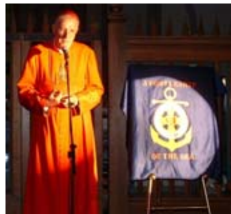
Cardinal Cormac Murphy O'Connor, AOS Patron, preached at St. Paul's Cathedral, London for the UK's 99th Annual National Service for Seafarers. In the crypt, he unveiled a painting specially commissioned for the occasion. (See page 7)