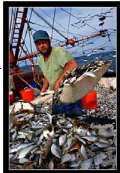
A Gulf Shimper hard at work